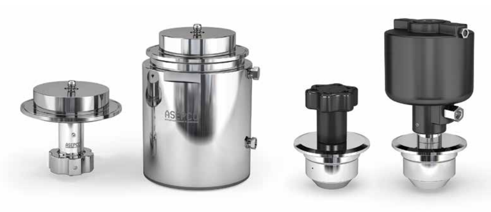
AJS Series AKS Series

The operation of AJS and AKS pneumatic actuators can be automated using ASEPCO switches, or any manufacturers' linear switch and controller without the need for modification.