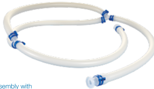
puresu tube assembly with PureWeld XL tubing, BioBarbs and Bio Y

Work with us to design you a perfect customised fluid path solution for your application.