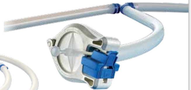
puresu tube assembly with Pumpsil tubing, BioBarb, connectors, Platinum-cured silicone gaskets and Q-Clamp sanitary Tri-Clamp